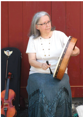
The fiddle is at rest while I play the bodhran, an Irish frame drum.

The Former An Corien Gallery University of Connecticut Library CT Legislative Office Building Connecticut Valley Calligraphers The Old State House, Hartford, CT Avon Public Library, Avon, CT Booth & Dimock Library, Coventry, CT Coventry Arts Guild - Arts in the Park Arts of Tolland - Two Woman Show Mill Brook Place, Coventry CT Arts Guild