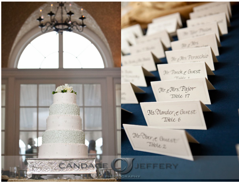
Photo of my handlettered tent cards