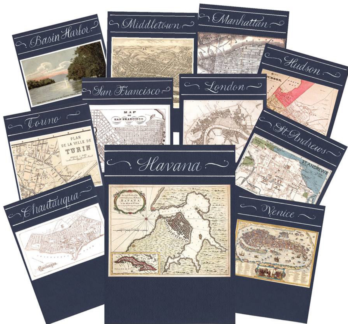
Destination Table Cards for a Wedding to be held at the National Arts Club in New York City. Hand-lettered towns and cities with accompanying maps.