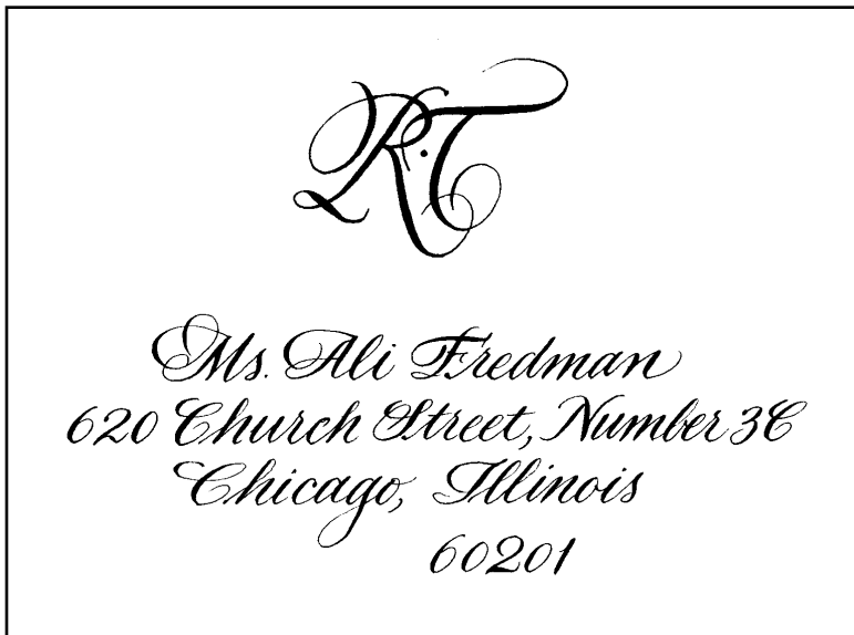
Duogram design and envelope lettering